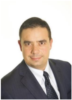
R&R Weekly Column By Brunello Rosa