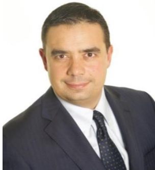
R&R Weekly Column By Brunello Rosa