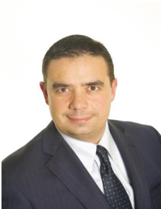
R&R Weekly Column By Brunello Rosa